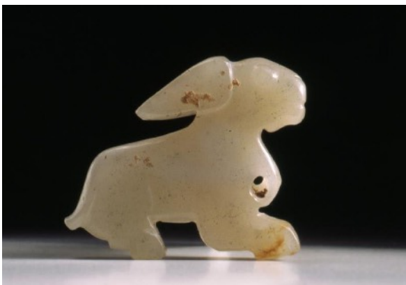
Pendant in the shape of a hare. China; Western Zhou period 1050-771 BCE. Nephrite. Asian Art Museum, The Avery Brundage Collection, B60J573 .